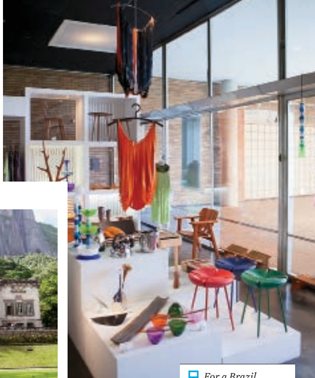
For a Brazil itinerary inspired by Travel + Leisure, go to travandleisure.com/coxandkings .