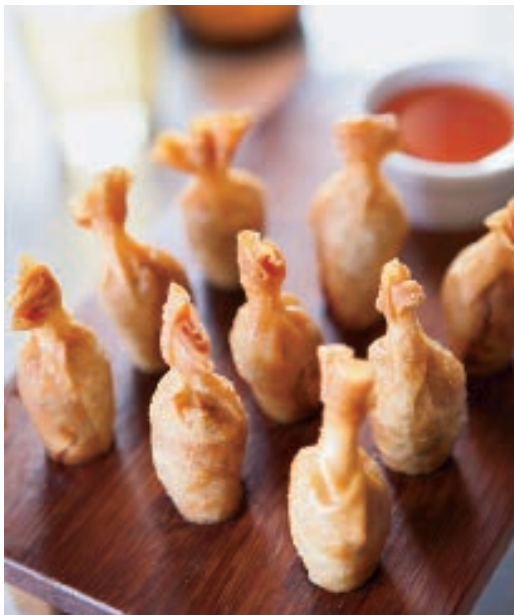
From left: Pork “carrots” with pepper jelly at Armazém São Thiago; Parque Lage; décor on display at the Novo Desenho shop in MAM Rio.