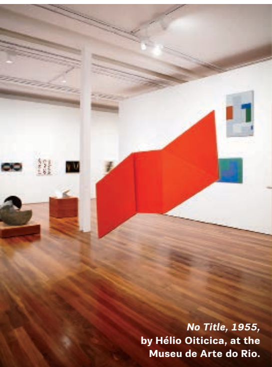
No Title, 1955, by Hélio Oiticica, at the Museu de Arte do Rio.