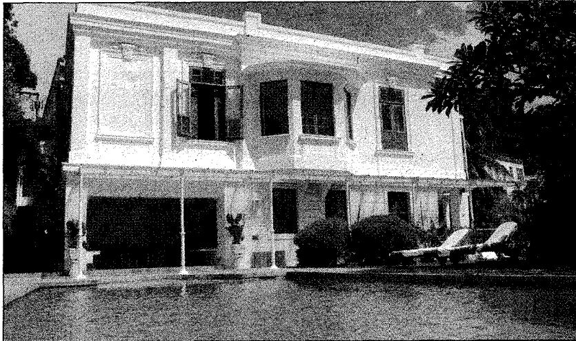
Boutique charm: the Parisian-run Mama Ruisa hotel is a favourite of Rupert Everett.

For more details visit www.santateresa.tur.br