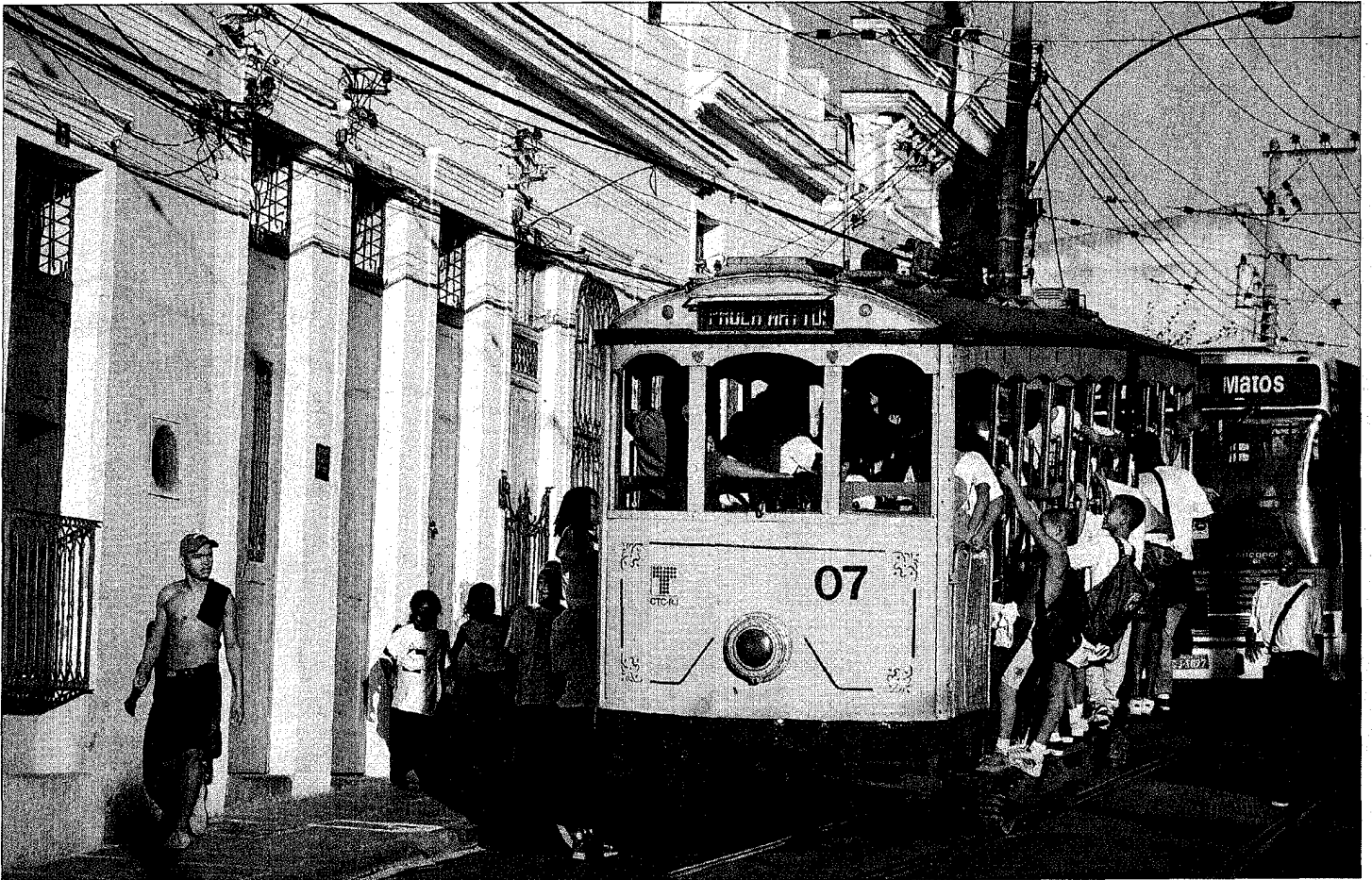
Streetcar desire: the rickety 'bondinho' tram that winds up to Santa Teresa from downtown Rio de Janeiro.