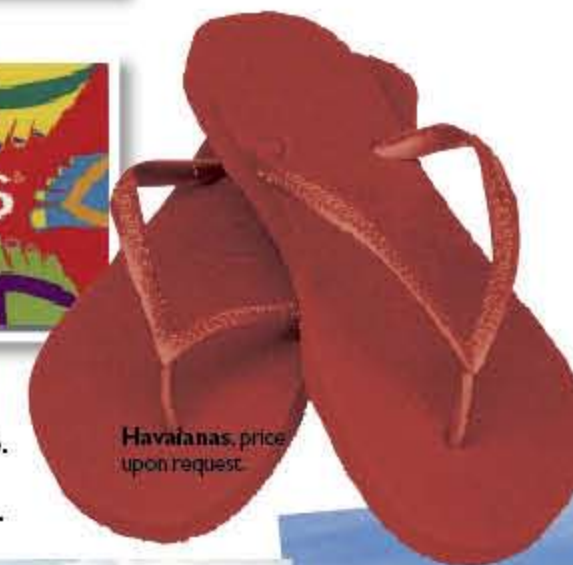
Havaianas, price upon request.

The uniform dress shoe of fashionistas and locals alike. No ensemble is complete without the iconic Havaiana.