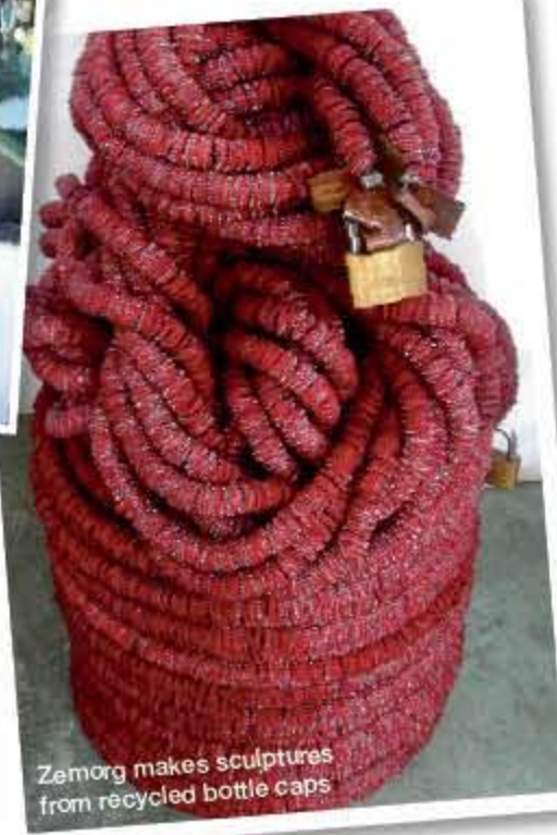
Zemorg makes sculptures from recycled bottle caps