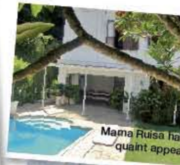
Mama Ruisa has quaint appeal