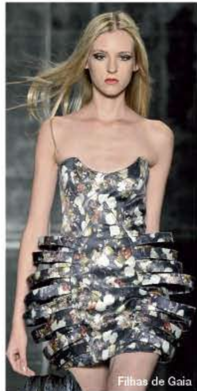
Filhas de Gaia

Rio de Janeiro Fashion Week sets ARJUN BHASIN off on a style quest through the city's chic streets