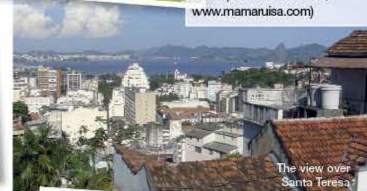
The view over Santa Teresa