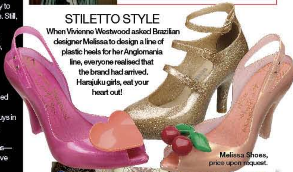
Melissa Shoes, price upon request.

When Vivienne Westwood asked Brazilian designer Melissa to design a line of plastic heels for her Anglomania line, everyone realised that the brand had arrived. Harajuku girls, eat your heart out!